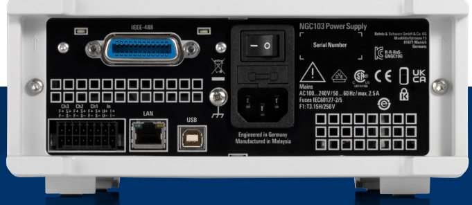
R&S®NGC103-G rear view